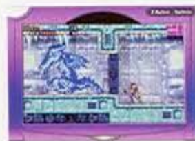
Metroid Fusion: ©2002 Nintendo