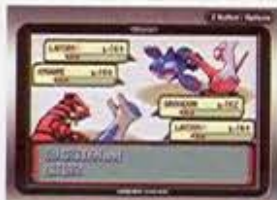
Pokémon Ruby & Sapphire