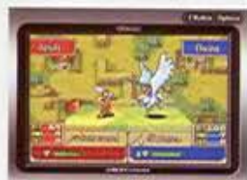
Fire Emblem: ©2003 Nintendo/INTELLIGENT SYSTEMS