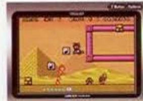
Super Mario® Advance 4: Super Mario Bros.® 3: ©1983-2003 Nintendo